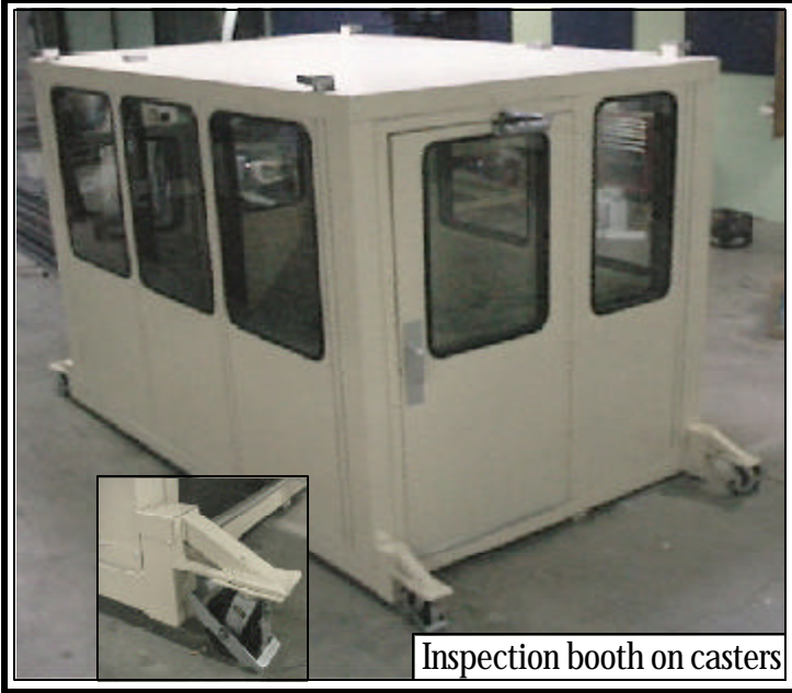
Inspection booth on casters