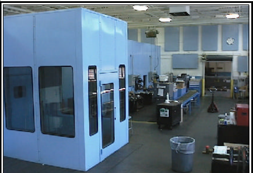
Rigid enclosure used in conjunction with wall absorbers