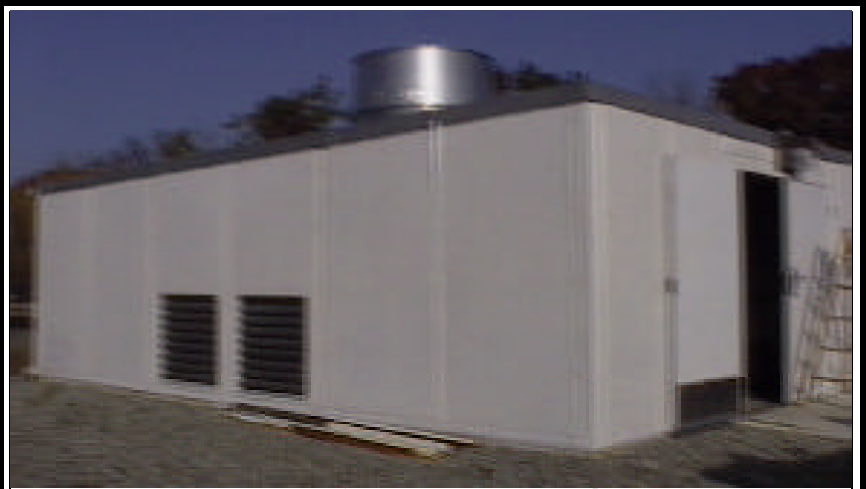
Rooftop Compressor Enclosure

Rigid metal noise control enclosures, as manufactured by Sound Barriers, Inc. , incorporate an 18 GA solid exterior skin with an 18 GA interior perforated skin, with a 4 lb/cu. ft. density acoustic fill core. Enclosures are designed to both contain and absorb noise, and to act as a barrier between noisy and quiet areas.